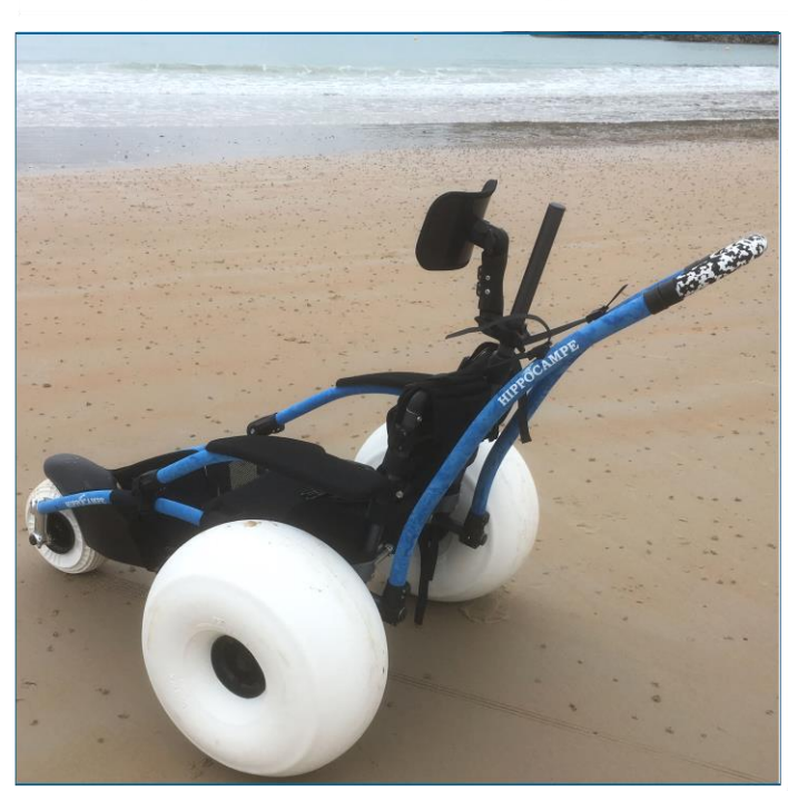
Fundraising and Donations

Even if it does remain a bit chilly, the ladies of the Communicare Needlework Group and L'Hermitage have been busy over the winter and produced lots of beautiful and colourful blankets which will keep our users well protected fro m the sea breezes. Each year these ladies choose a charity – alternately local and international – to support and this year Beach-Ability was lucky to be the chosen one. Thank you ladies, your hard work is much appreciated.