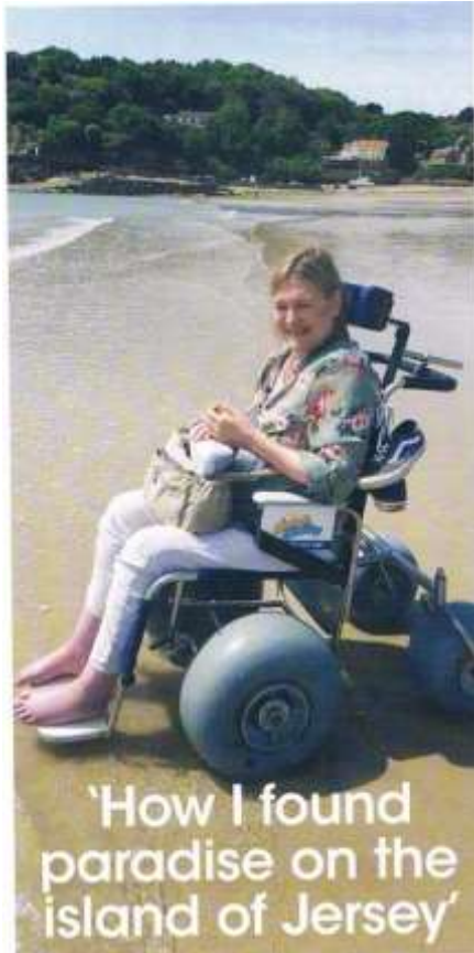
'How I found paradise on the island of Jersey'